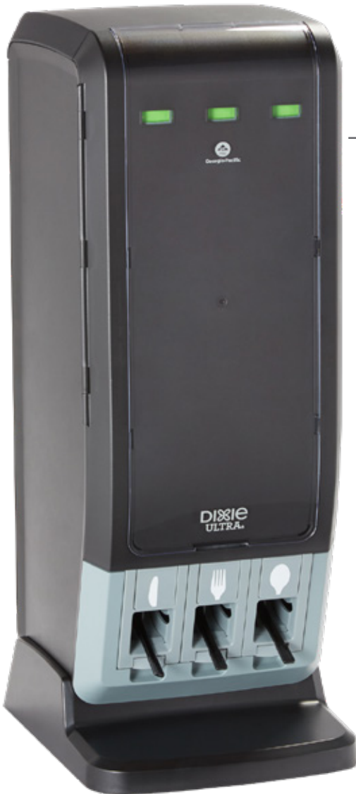
Tri-Tower Dimensions - 29"H x 10.53"W x 12.74"D