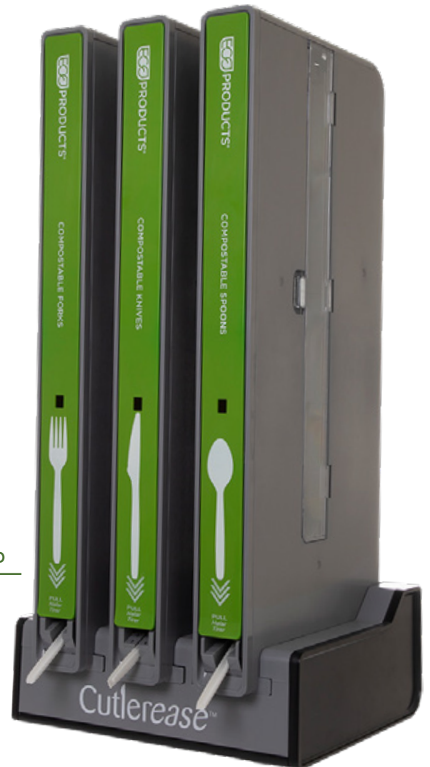
Cutlerease Dimensions - 26.5"H x 12.5"W x 11.5"D